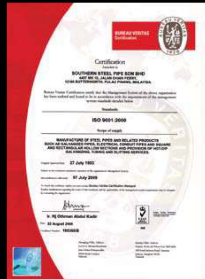
ISO 9001:2000 Certificate from Bureau Veritas

The many certifications garnered through the years are testament to the companies' steadfast commitment in providing only the best products & services. Among others, it has the distinction of being the first steel mill in the country to be awarded the ISO 9001:2000 certification. The group's product lines were being exported to countries all over the world.