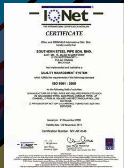
ISO 9001:2000 Certificate from SIRIM QAS