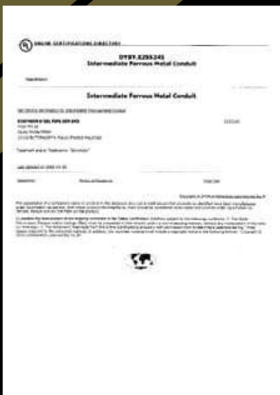
IMC Certificate from UL