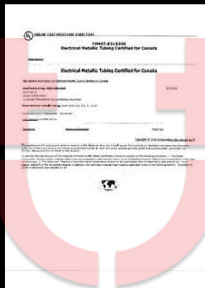
EMT Certificate from UL for Canada