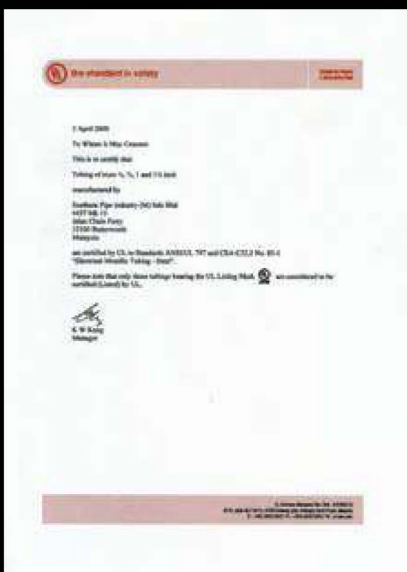
IMC Certificate from UL