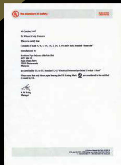
EMT Certificate from UL