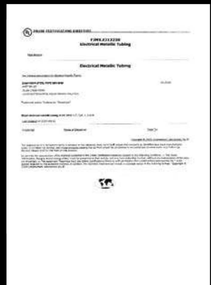
EMT Certificate from UL