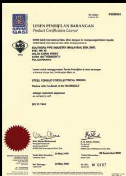
BS 31:1940 Certificate from SIRIM QAS